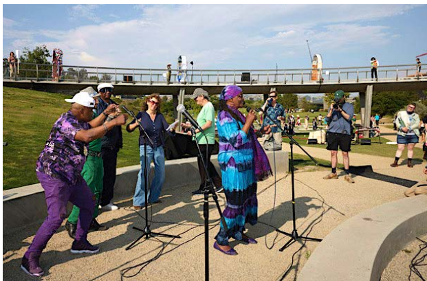
LAPD performs "Resilience" at Heal, Hear, Here Festival - 5/20/23

Los Angeles Poverty Department's Skid Row performance troupe made, " Resilience ", a performance derived from Charles' concerns, and focused on individuals' innate abilities for self-realization and fulfillment, to heal themselves.