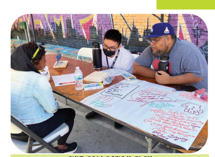
SKID ROW ACTION PLAN AND THE LA COUNTY DEPARTMENT OF MENTAL HEALTH getting input about housing Skid Row residents