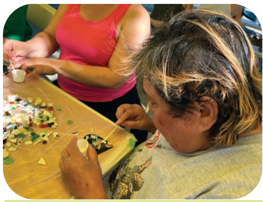
PIECE BY PIECE