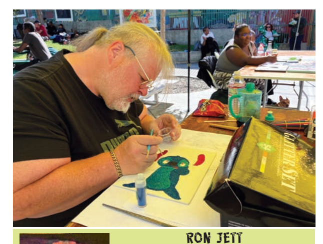
I make glitter portraits. This one is my fovorite work. It is my only abstract glitter piece. I created it by accident because I spilled the glitter and then I had this shape to work with and I just went with it and worked with the colors and shapes. It looks like a tree in Japan. I like it.

This is just one of my multi-expressions. Me showing other people that you can dress however you want to dress on whatever day of the week you want to be. It doesn't have to be a special holiday. It doesn't have to be a special occasion. It just has to be because you feel like it and it makes you happy. That's one of the biggest messages I want to get to people. To be fully open and accepting of themselves for who they are.