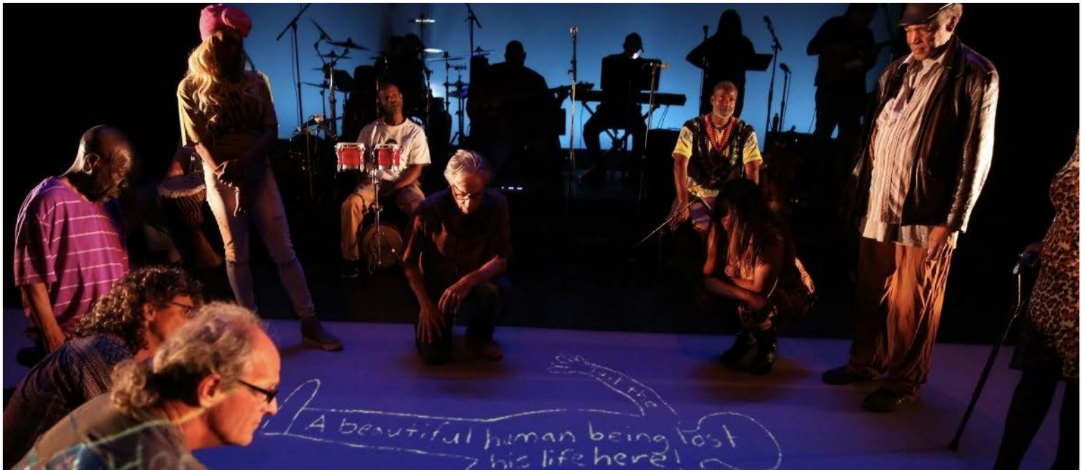
Los Angeles Poverty Department LAPD performance of "I fly! or How to Keep the Devil Down in the Hole" at REDCAT