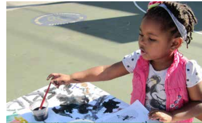
Having fun at the creativity station