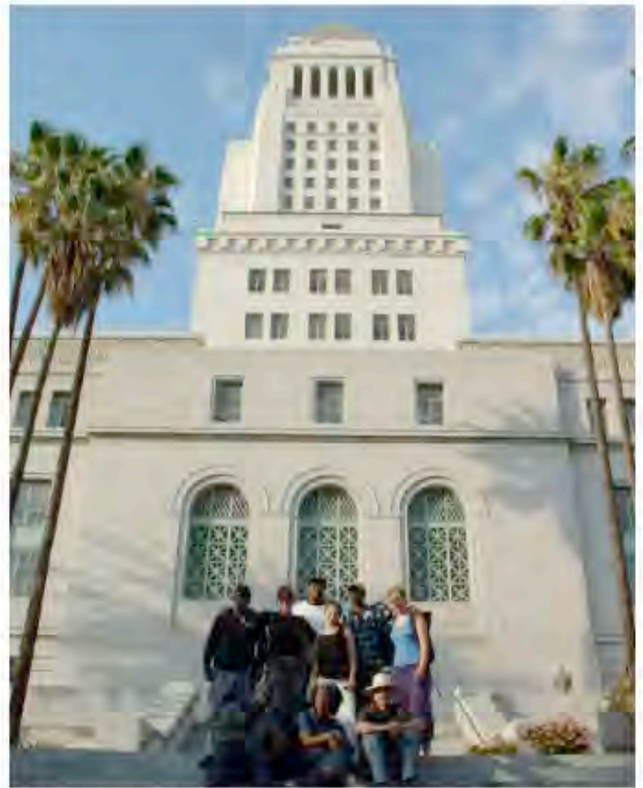
LAPD’ers and Summer Workshop guests pause and pose before attending a hearing at City Hall.