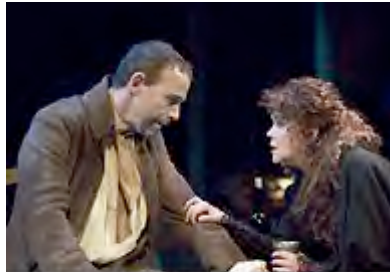
Mourning Becomes Electra A Noise Within

Two productions closing this weekend in Los Angeles highlight this ability, which literally brings the audience into the same space as participants of past American struggles.