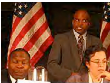
Agents and Assets Los Angeles Poverty Center

Right now the Global War on Terror is stealing some of the War on Drugs' thunder, but this play--staged by the innovative troupe known as the Los Angeles Poverty Department --makes it clear that these two conflicts are closely related.