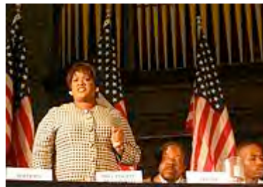
Agents and Assets Los Angeles Poverty Center

Having the lawmakers played by people who have probably suffered from the policies enacted by the characters that they're portraying is a brilliant coup de theatre; but more striking are the words themselves, which are reportedly quoted verbatim from the congressional record. What these words make clear--regardless of who's speaking them--is that the failures of the War on Drugs (committed by multiple administrations of both parties) are woefully being repeated today in the War on Terror.